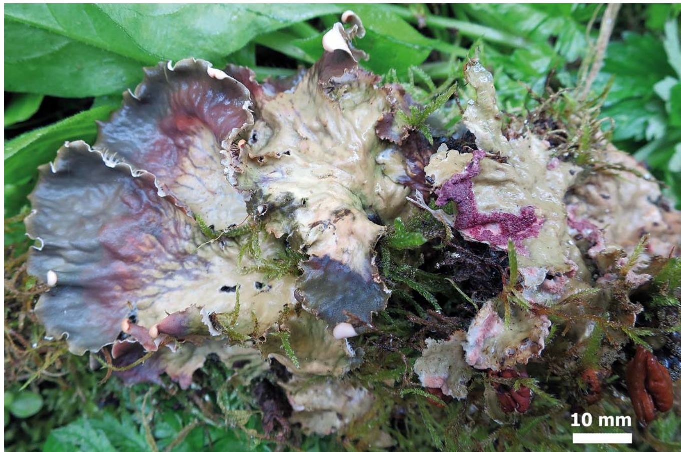
Fig. 1 – Hypomyces peltigericola in natural environment

tunicate asci with a thickened apex and fusiform, usually two-celled, biapiculate and warted ascospores; asexual morphs were assigned to various hyphomycetous genera including acremonium-like, Cladobotryum , Mycogone , papulaspora-like, Stephanoma , Sepedonium and verticillium-like. HELFER (1991) introduced the term “aurofusarin-group” to accommodate Hypomyces spp. having in common the production of aurofusarin, the molecule responsible for the red colour, either during the sexual or the asexual stage. The monophyly of this group was supported by subsequent phylogenetic analyses (PÖLDMAA et al. , 1999; PÖLDMAA, 2000; PÖLDMAA & SAMUELS, 2004). PÖLDMAA (2011) and TAMM & PÖLDMAA (2013) revised Hypomyces spp. of the aurofusarin-group, introducing eight new tropical species and delimitating a group of thirteen monophyletic species within Hypomyces .